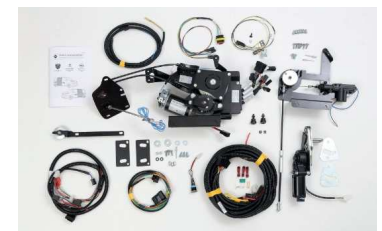
Scope of delivery basic package

Ador Europe c/o BBT Sauer Engin. office Fellhornweg 24 D-89231 Neu-Ulm